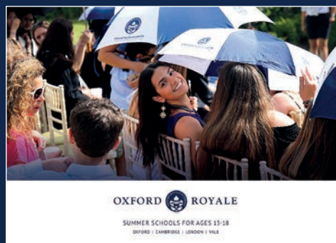
Summer Schools for Ages 13-18